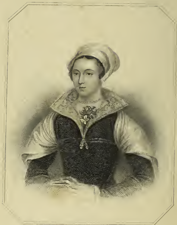
LADY JANE GREY.